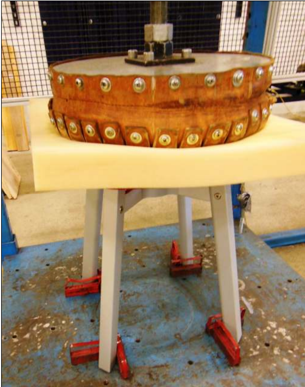
Seating Impact Test