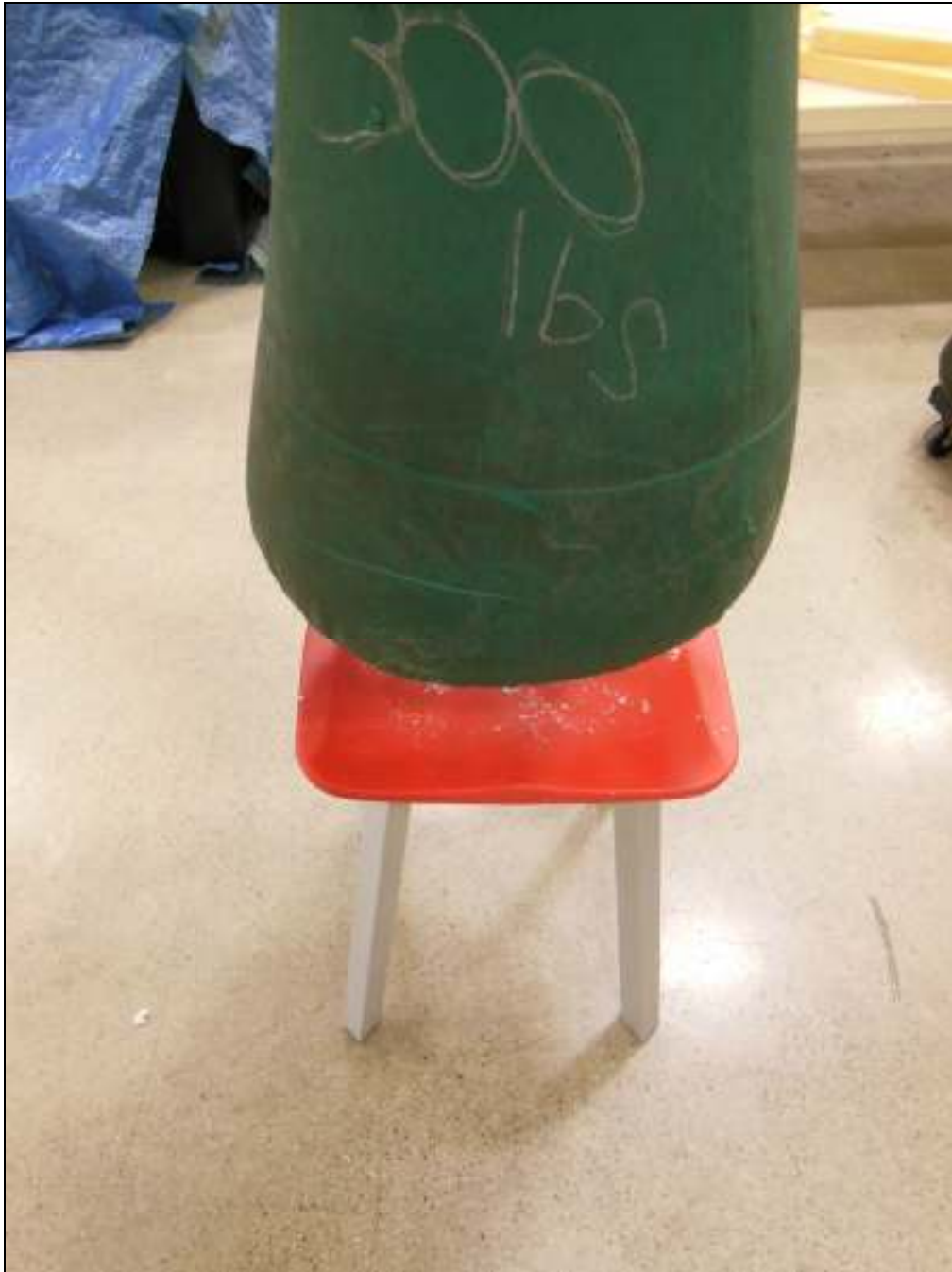
DROP TEST – DYNAMIC