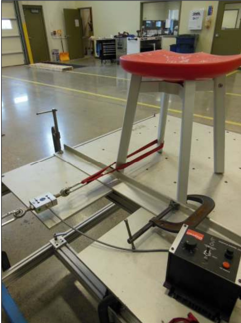
LEG STRENGTH TEST