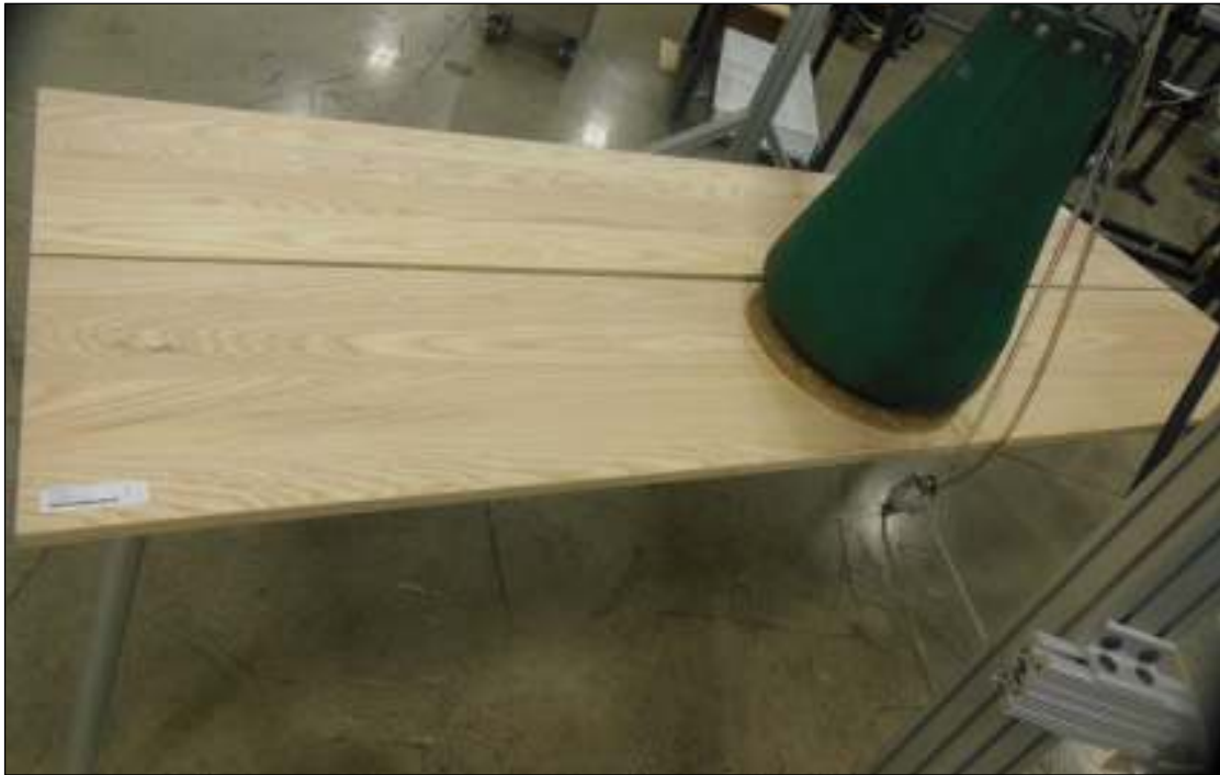
Top Load Ease Test