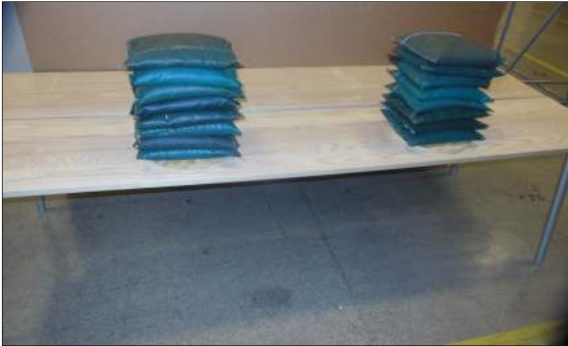
Concentrated Functional Load Test