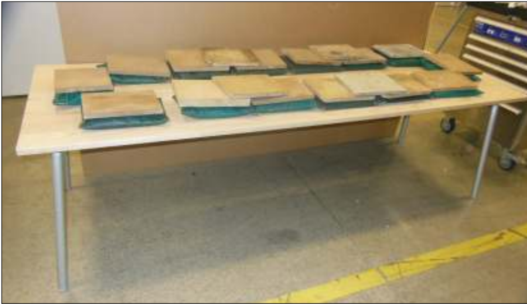
Distributed Functional Load Test