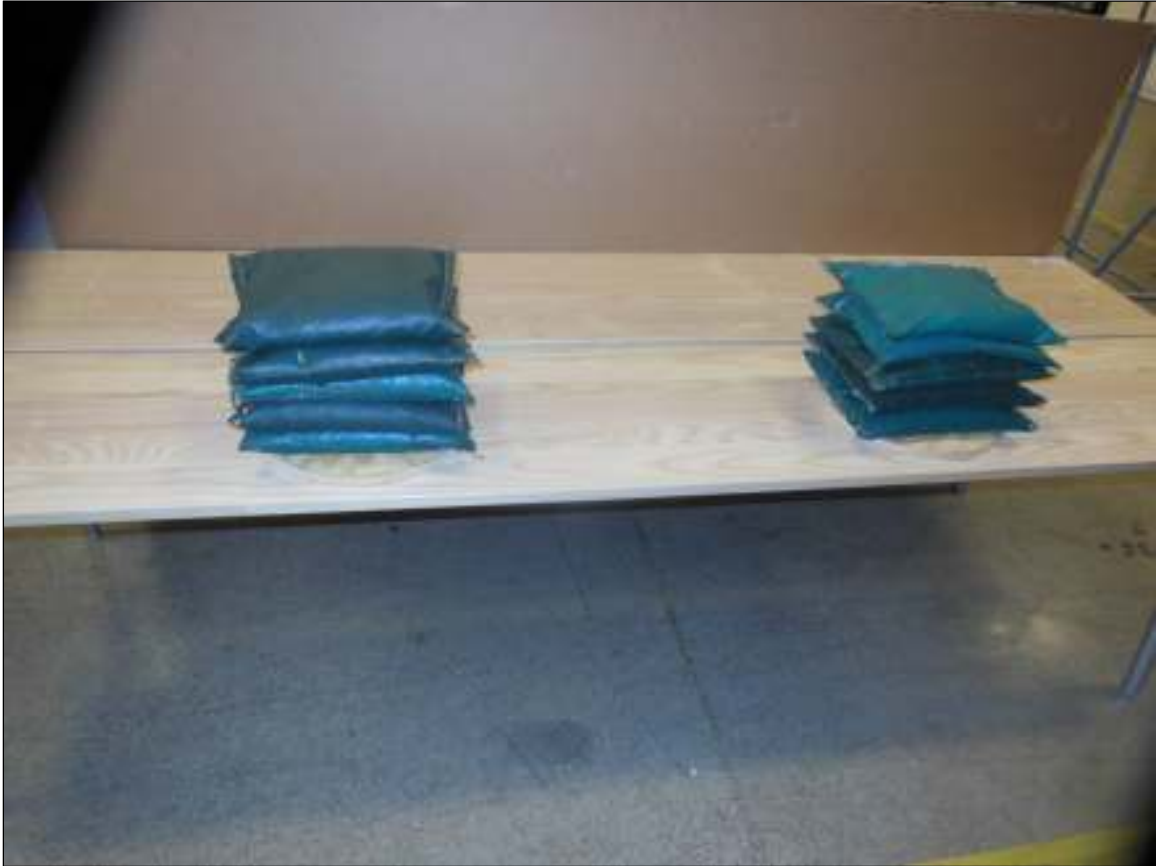
Stability Under Vertical Load Test