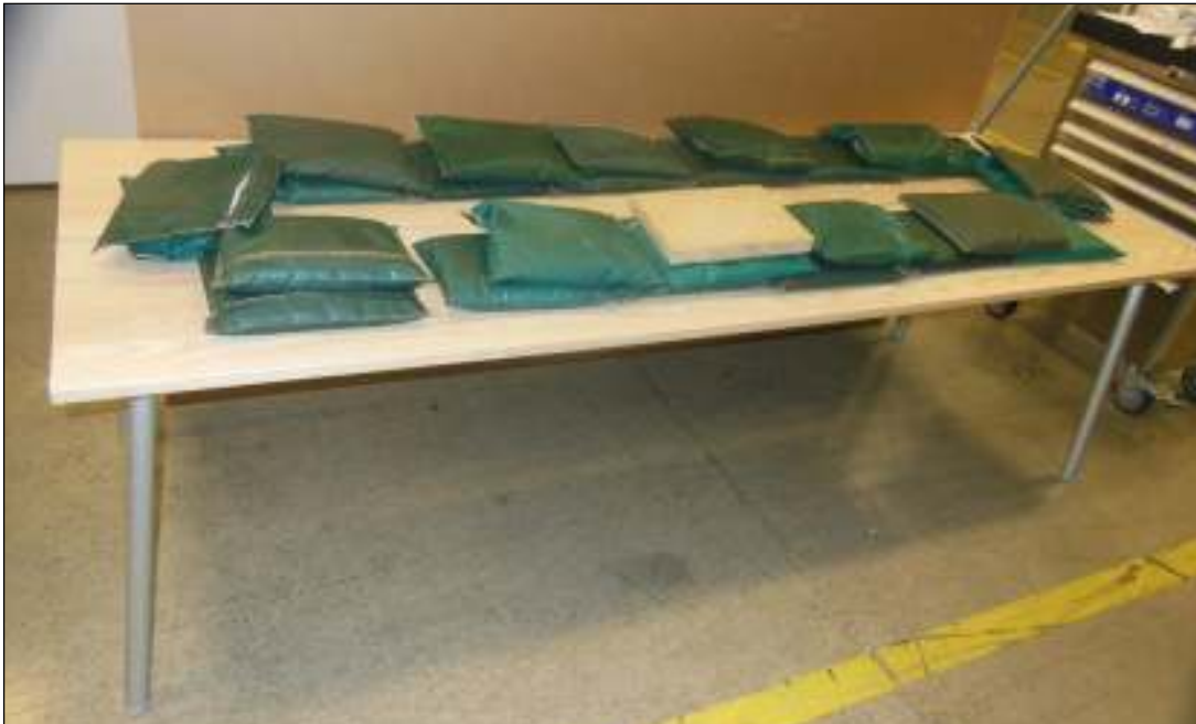
Distributed Proof Load Test