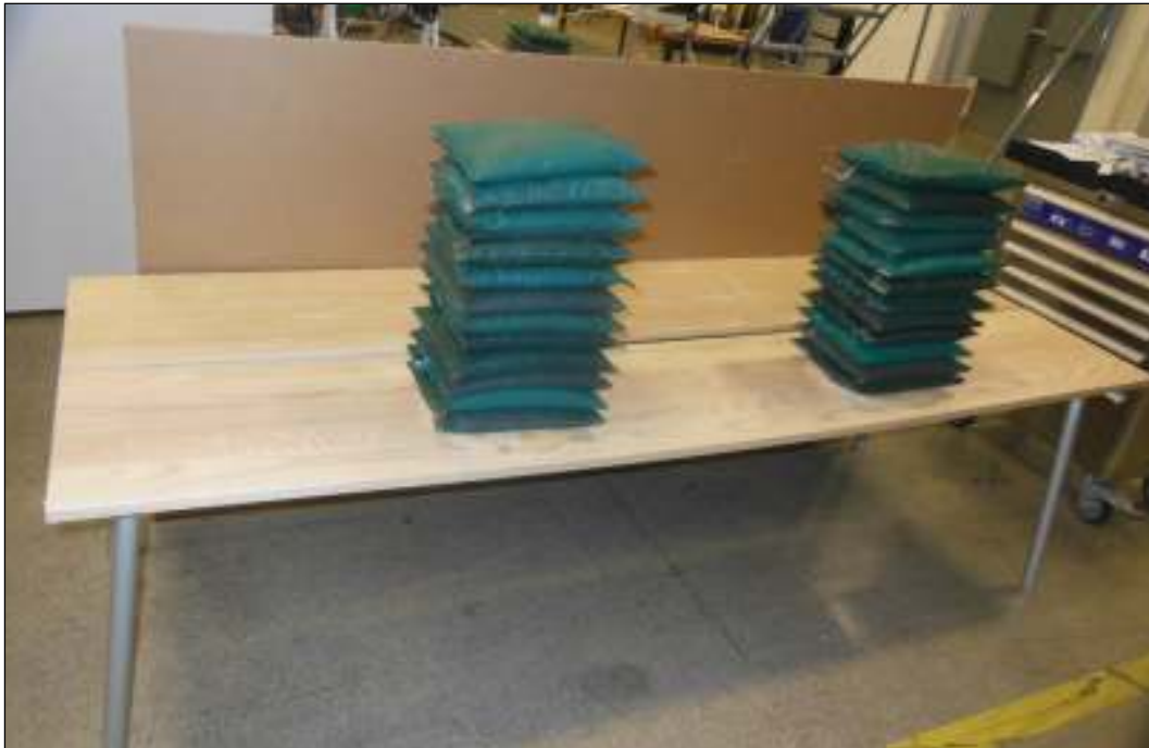
Concentrated Proof Load Test