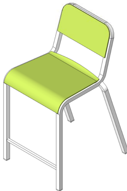
④ 3D View